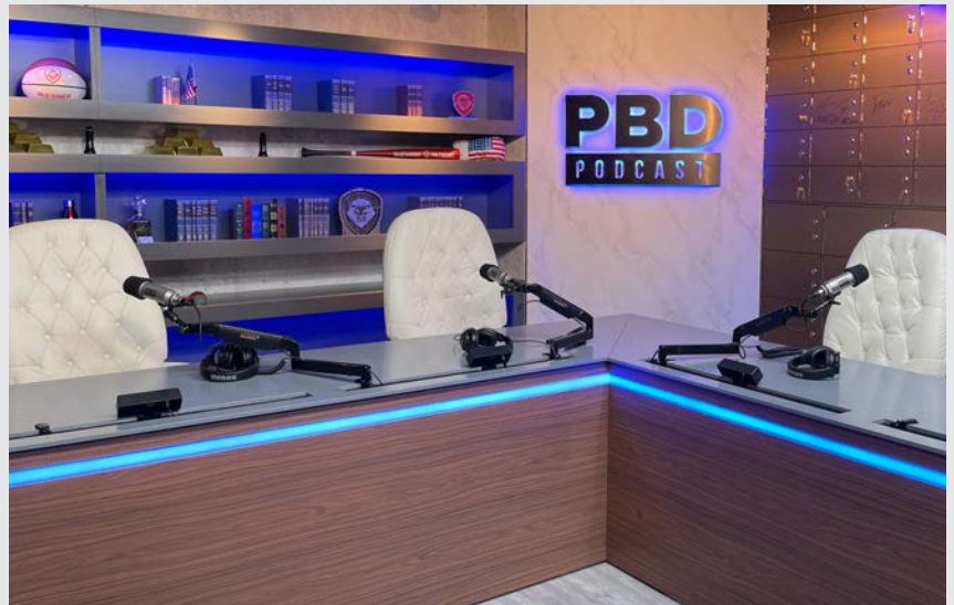
FORT LAUDERDALE, FL - STUDIO